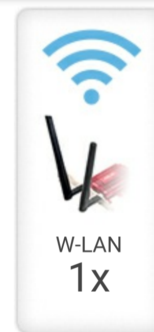
Rear of the PC